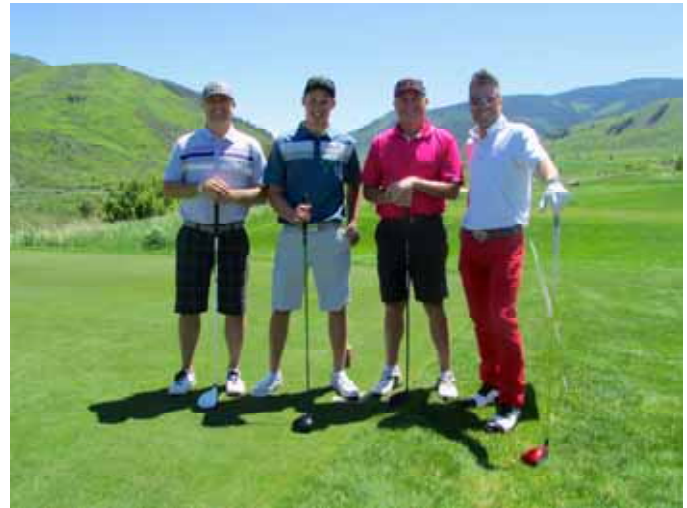
Congratulations to our 1st place winners, the Adam's Mountain Team

The June 9 th Christel House Open was held at Adam's Mountain Country Club in Eagle, CO, at the beautifully designed Tom Weiskopf course. This tournament is the lodge's foremost philanthropic mission and for the 11 th year in a row, we co-hosted the annual tournament with Breckenridge Grand Vacations. We had another record-breaking year and raised over $65,000.00 for the kids! A portion of that revenue will stay here in Eagle County in support of Roundup River Ranch, our local charity.