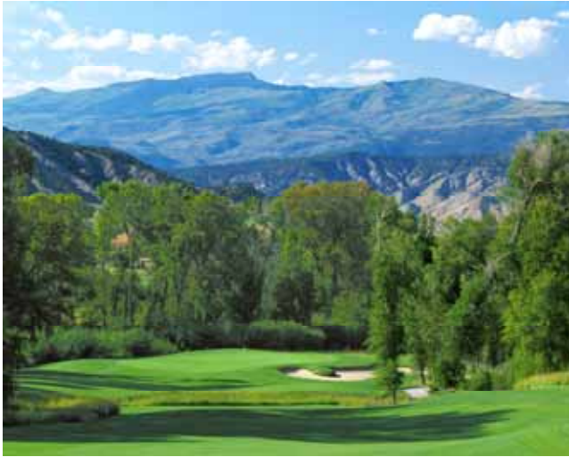
Adam's Mountain Country Club, Eagle